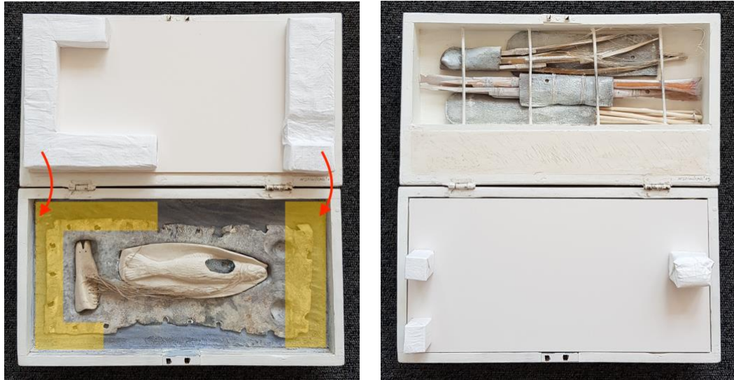
Left: insert to be placed as shown. Right: insert in position.