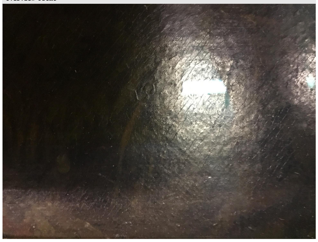
5. Minor Cracking Lower Right Corner \, D \, / Cracks \, / 11 Aug 2017 \, / Detail of 1. Overview Front